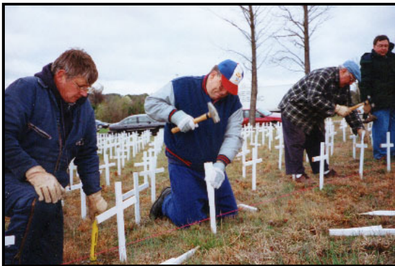
Volunteers erect 4,000 white crosses to commemorate the lives that are lost to abortion every year.

The sobering display of white crosses that is seen throughout the state of Arkansas will be in Mountain Home for nearly a month beginning March 18. It is a visual reminder to all that the freedom to choose life is withheld from the most vulnerable and least vocal of our society. The display will be inaugurated on the evening of March 18 with a gathering marked by